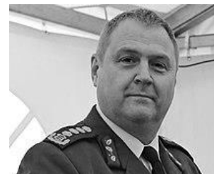
General Riho Terras Former Commander Estonian Forces