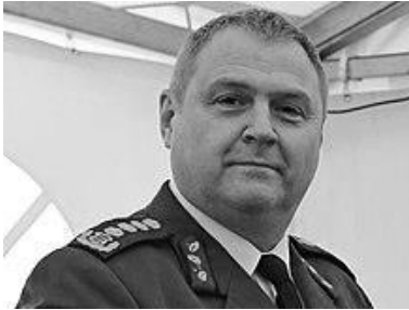
General Riho Terras Former Commander Estonian Forces

Riho Terras (born 17 April 1967) is an Estonian Army general and former Commander of the Estonian Defence Forces. His military education includes studies in the Royal College of Defence Studies in the United Kingdom, the Joint Command and General Staff Course in the Baltic Defence College, the European Security. Terras's civilian education includes history studies in the University of Tartu, and a master's degree in Political Science and Sociology from the University of Bundeswehr. [2] After graduating from the Basic Officer's Course in Estonia, Terras served as a Company Commander and as a Battalion Second in Command of the Kalev Single Infantry Battalion from 1992 to 1993. In 2007, Terras served in the NATO Training Mission - Iraq as Deputy Chief of Staff. Riho Terras was confirmed on December 2008 as Permanent Secretary of the Estonian Ministry of Defence. Before taking up the position of the Permanent Secretary, he was Deputy Chief of Staff for Operations in the Estonian Defence Forces. Terras served as the Deputy Chief of Staff for Operations of the Estonian Defence forces from January 2011 to March 2011 and then continued his service as the Chief of Staff of the Estonian Defence Forces. Terras was appointed the Chief of Defence from December 5, 2011 [2]