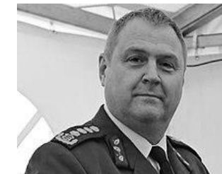
General Riho Terras Former Commander Estonian Forces